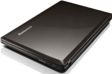
Lenovo G480/G580 Dark Brown (Glossy)